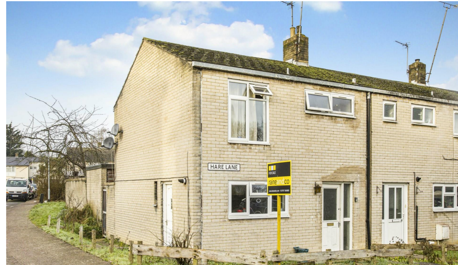
Three-Bedroom End-of-Terrace Corner Plot Property with lots of potential and CHAIN FREE.